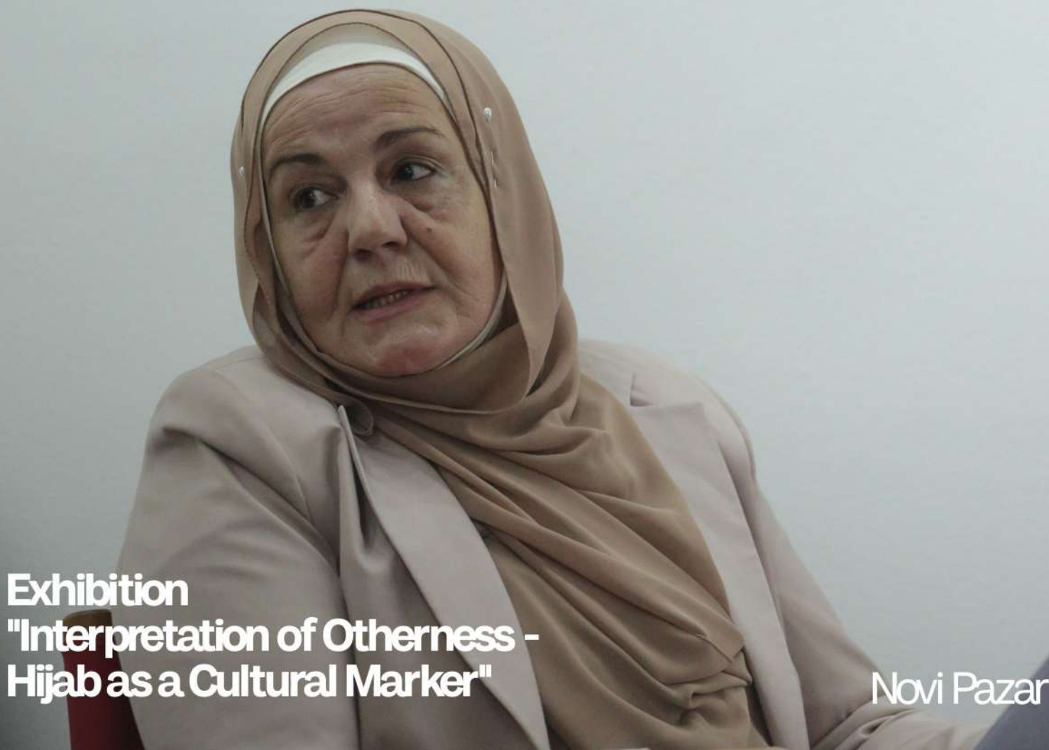
Exhibition "Interpretation of Otherness - Hijab as a Cultural Marker"