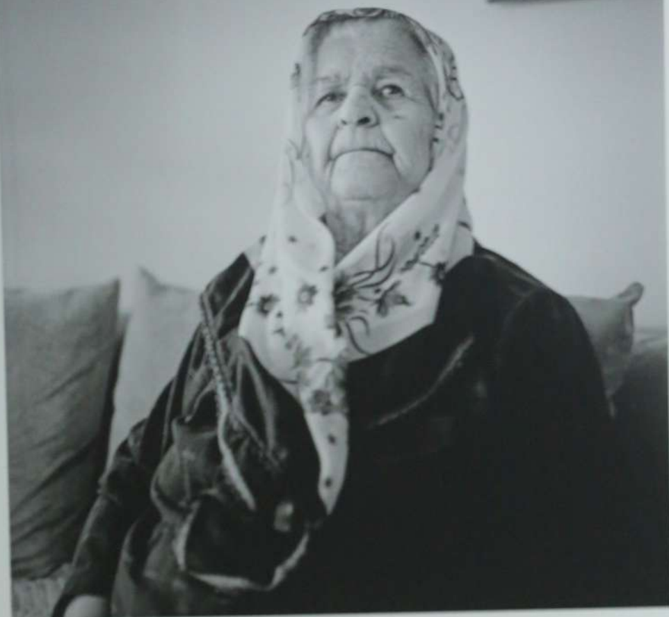
Madame President, Madam Chair 1998, 2000