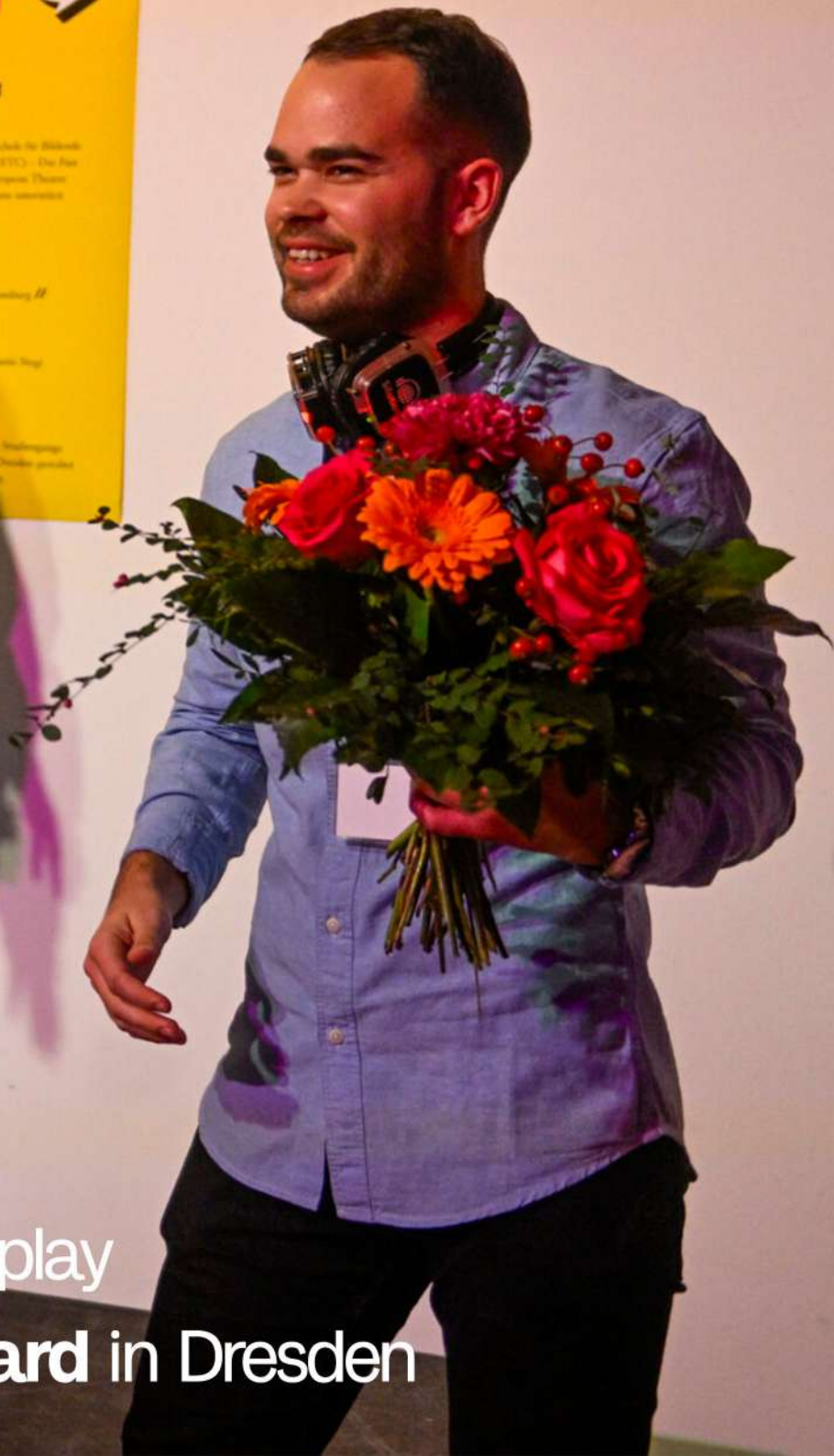
Play Our Son / Award for the best play Festival Fast Forward in Dresden